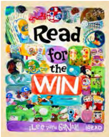
Chris Raschka Children's poster

Chris Raschka is an American illustrator, writer, and violist. He was U.S. nominee for the biennial, international Hans Christian Andersen Medal in 2012; his Yo! Yes? was a Caldecott Honor Book in 1994. Raschka may be most famous for his Hello, Goodbye Window , winner of the 2006 Caldecott Medal and for A Ball for Daisy which won the 2012 Caldecott Medal.